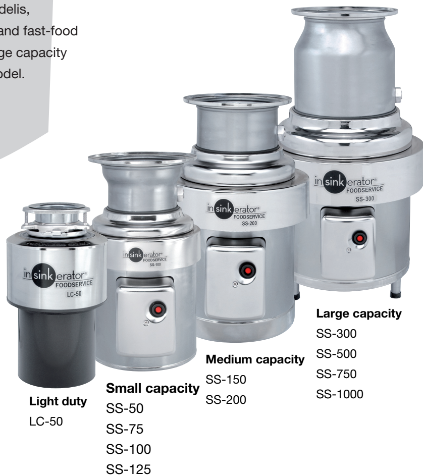
Light duty LC-50